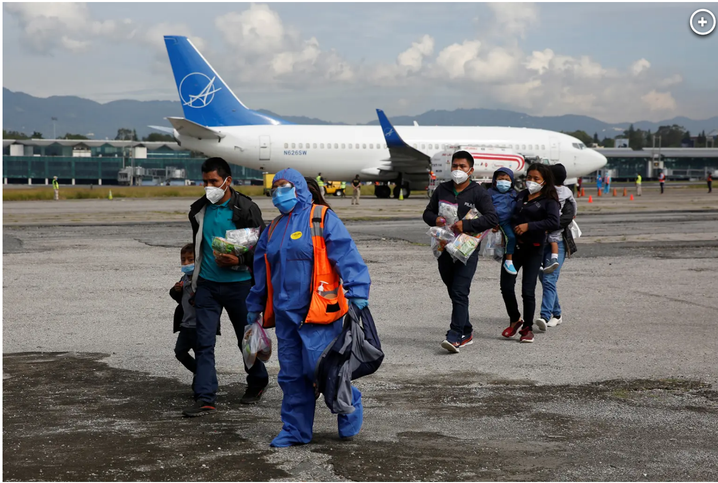
A government employee escorts families deported from the US at La Aurora International airport in Guatemala City, Guatemala on August 4, 2021.