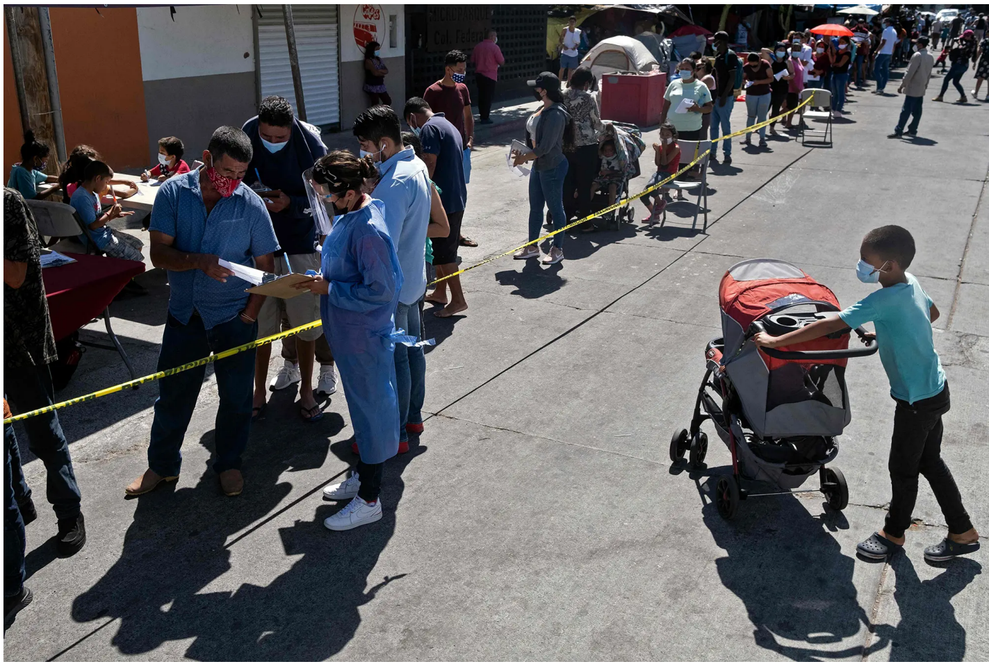
Asylum seekers line up for the COVID-19 vaccine at El Chaparral crossing port in Tijuana, Mexico on August 3, 2021.

Immigration officials say that once illegal immigrants are expelled under Title 42, there is no mechanism preventing them from attempting to cross the border again. US Customs and Border Protection are estimated to have stopped more than 200,000 illegal immigrants at the southwest border last month; it is unclear how many of those had made more than one attempt.