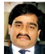
INTERPOL Fugitive Dawood Ibrahim, South Asia “Company D”

Afghanistan/Southwest Asia: Nowhere is the convergence of transnational threats more apparent than in Afghanistan and Southwest Asia. The Taliban and other drug-funded terrorist groups threaten the efforts of the Islamic Republic of Afghanistan, the United States, and other international partners to build a peaceful and democratic future for that nation. The insurgency is seen in some areas of Afghanistan as criminally driven—as opposed to ideologically motivated—and in some areas, according to local Afghan officials and U.S. estimates, drug traffickers and the Taliban are becoming indistinguishable. In other instances, ideologically