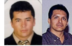
Mexico Los Zetas Cartel Leaders Heriberto Lazcano-Lazcano and Miguel Angel Treviño Morales

Western Hemisphere: TOC networks—including transnational gangs—have expanded and matured, threatening the security of citizens and the stability of governments throughout the region, with direct security implications for the United States. Central America is a key area of converging threats where illicit trafficking in drugs, people, and weapons—as well as other revenue streams—fuel increased instability. Transnational crime and its accompanying violence are threatening the prosperity of some Central American states and can cost up to eight percent of their gross domestic product, according to the World Bank. The Government of Mexico is waging an historic campaign against transnational criminal organizations, many of which are expanding beyond drug trafficking into human smuggling and trafficking, weapons smuggling, bulk cash smuggling, extortion, and kidnapping for ransom. TOC in Mexico makes the U.S. border more vulnerable because it creates and maintains illicit corridors for border crossings that can be employed by other secondary criminal or terrorist actors or organizations. Farther south, Colombia has achieved remarkable success in reducing cocaine production and countering illegal armed groups, such as the FARC, that engage in TOC. Yet, with the decline of these organizations, new groups are emerging such as criminal bands known in Spanish as Bandas Criminales , or Bacrim s.