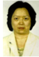
Cheng Chui Ping, convicted alien smuggler

Asia/Pacific: TOC networks and DTOs are integrating their activities in the Asia/Pacific region. Due to the region's global economic ties, these criminal activities have serious implications worldwide. The economic importance of the region also heightens the threat posed to intellectual property rights, as a large portion of intellectual property theft originates from China and Southeast Asia. Human trafficking and smuggling remain significant concerns in the Asia/Pacific region, as demonstrated by the case of convicted alien smuggler Cheng Chui Ping, who smuggled more than 1,000 aliens into the United States during the course of her criminal career, sometimes hundreds at a time. TOC networks in the region are also active in the illegal drug trade, trafficking precursor chemicals for use in illicit drug production. North Korean government entities have likely maintained ties with established crime networks, including those that produce counterfeit U.S. currency, threatening the global integrity of the U.S. dollar. It is unclear whether these links persist. The United States will continue to improve its understanding of the TOC threats in the Asia/Pacific region and will work with partner nations to develop a comprehensive response.