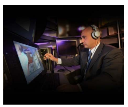
A Cyber Crime Center special agent reviews material for a case.

• Removed more than 300 individuals involved in High Profile Removal cases, including a former Federal Guatemalan Police Officer wanted for murder, a Top-10 most wanted Vietnamese fugitive, a citizen of Rwanda wanted for inciting and participating in genocide, a citizen of Kazakhstan convicted of conspiracy to obstruct justice and obstruction of justice in relation to the Boston Marathon bombing, and other known or suspected terrorists.