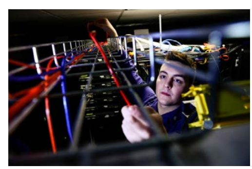
An Information Systems Technician maintains critical network infrastructure.

The Defense Operations program exercises the Coast Guard's unique authorities and capabilities to support the National Military Strategy. The program portfolio comprises eight activities including: Maritime Interdiction Operations; Combating Maritime Terrorism; Port Operations Security and Defense; Military Environmental Response Operations; Coastal Sea Control Operations; Maritime Operational Threat Response (MOTR); Rotary Wing Air Intercept Operations; and Support for Theater Security Cooperation Initiatives.