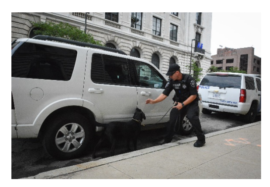
An NPPD inspector and his canine protect a Federal facility.

Agency for nine of the 16 critical infrastructure sectors and serves as the national coordinator for the remaining sectors. Through established partnerships, NPPD leads national infrastructure protection efforts and builds infrastructure security and resilience by delivering security related technical assistance, training, analysis, and assessments to infrastructure owners and operators nationwide. NPPD's Federal Protective Service (FPS) personnel execute its law enforcement authorities to protect Federal facilities, and those who work in and visit them, against physical and cyber threats.