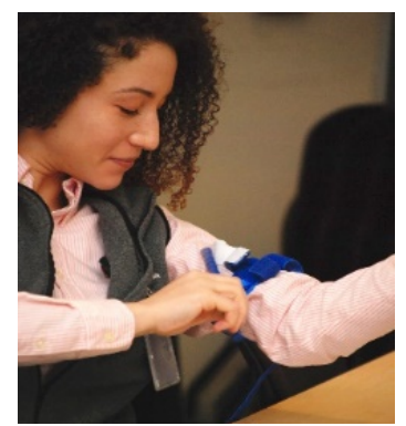
DHS Employees Learn to "Stop the Bleed"

Chemical and Biological Readiness: OHA Chemical and Biological Readiness (CBR) programs inform Federal, State, local, tribal, and territorial decision-making about high consequence biological and chemical threats. OHA manages a national biological detection system, coordinates DHS biological defense activities, and supports preparedness for biological and chemical events to help communities nationwide prepare and build their capacity to respond and recover.