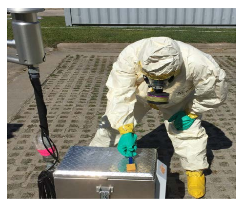
HAZMAT Team Practices Sampling Procedures for Responding to a Biological Incident