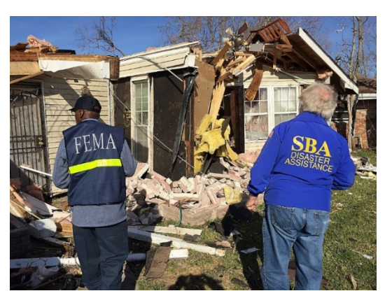
Figure 1 - State, FEMA and Small Business Administration representatives survey tornado damage in East New Orleans

By being survivor-centric in mission and program delivery, FEMA focuses on supporting and empowering disaster survivors, including individuals, households, organizations, and communities, by increasing their capacity to take effective and practical steps to help themselves, their families, and their communities. FEMA works to improve services for individuals during initial contact with the Agency, whether it involves individual registration for disaster assistance, referral resources, or reporting critical unmet needs. FEMA is implementing a new Public Assistance Model focusing on communities served in order