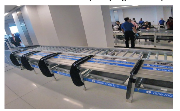
TSA's successful pilot of automated screening lanes includes this automatic bin return system.

The ITF is a TSA pilot program that provides industry with access to operational data