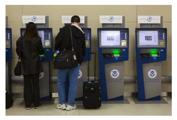
Arriving passengers use Global Entry kiosks to expedite their processing.