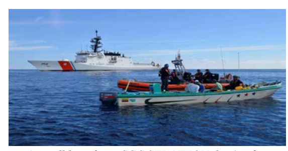
A small boat from CGC STRATTON detains four suspected drug smugglers in the Eastern Pacific Ocean transit zone.