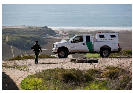
U.S. Border Patrol Agents conducts foot patrol in San Diego, California.

On January 25, 2017, President Trump signed Executive Order 13767, entitled Border Security and Immigration Enforcement Improvements . This Executive Order establishes the President's policy goals for effective border security and immigration enforcement. It establishes new policies designed to stem illegal immigration and facilitates enforcement of laws for the identification, apprehension, detention, and removal of aliens who have no lawful basis to enter or remain in the United States.