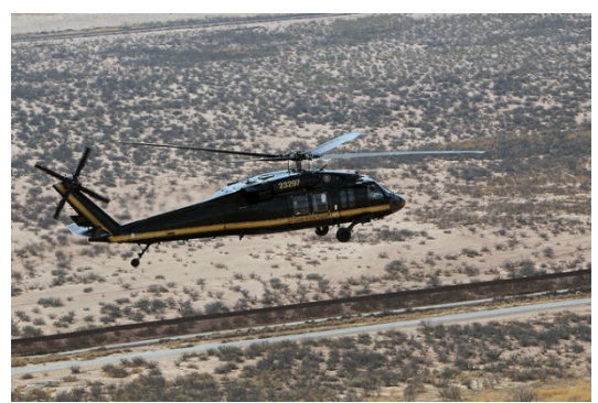
A CBP Black Hawk helicopter flies along the border fence line in Arizona.

voluntarily return to their country of origin, or allowed to withdraw their application for admission into the United States.