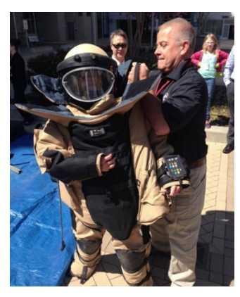
NPPD field-based employee implements protective measures.