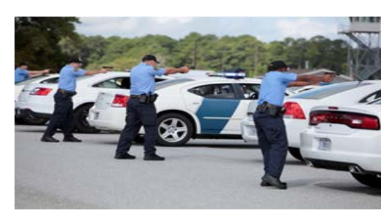
Basic training students participate in patrol and arrest tactics training

As the Nation's primary provider of law enforcement training, FLETC offers an efficient training model that delivers the highest quality training possible for those who protect the homeland.