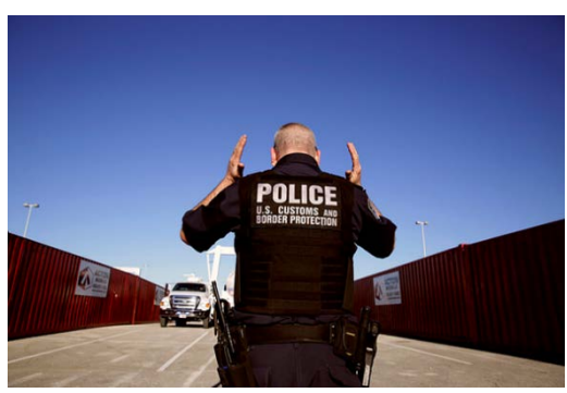
A Customs and Border Protection Officer guides an x-ray inspection truck in preparation for Super Bowl 51 in Houston, Texas.

The Executive Order prioritizes CBP operations, and establishes goals for border security and immigration enforcement. It directs the Secretary of Homeland Security to take immediate steps to obtain complete operational control of the southern border, including the construction of a physical wall using appropriate materials and border surveillance technology. In addition, the Executive Order directs CBP to take action to hire 5,000 additional Border Patrol agents.