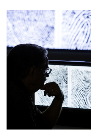
Fingerprints are analyzed for potential match against watch lists of known or suspected terrorists.

NPPD also improves private and public sectors' capacity to assess and manage their own cyber and physical risk. The regionally based field operations deliver training, technical assistance, and assessments directly to stakeholders to enable critical infrastructure owners and operators to increase their security and resilience. This includes working with public safety throughout the Nation to enable interoperable emergency communications, and with Federal agencies and industry partners to strengthen and maintain secure, functioning, and resilient critical infrastructure, including infrastructure that relies on and provides essential underlying support for position, navigation, and timing (PNT) systems. In addition, NPPD, through the Office of Infrastructure Protection (IP), regulates the security of the Nation's high-risk chemical facilities under the authority of the Chemical Facility Anti-Terrorism Standards (CFATS) Program.