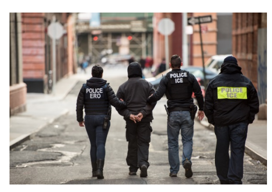
ICE officers arrest convicted criminal aliens and fugitives in enforcement operations throughout all 50 States.

• Conducted numerous targeted ERO operations, including Operation Cross Check, which targets specific alien populations, such as at-large criminals convicted of violent offenses or members of transnational criminal gangs. Through these operations, ERO made more than 2,500 arrests during FY 2016. ERO also conducted Operation Safe Haven, targeting aliens associated with human rights violations and war crimes in their home countries. In FY 2016, ERO arrested and removed an El Salvadoran national who had served as the country's