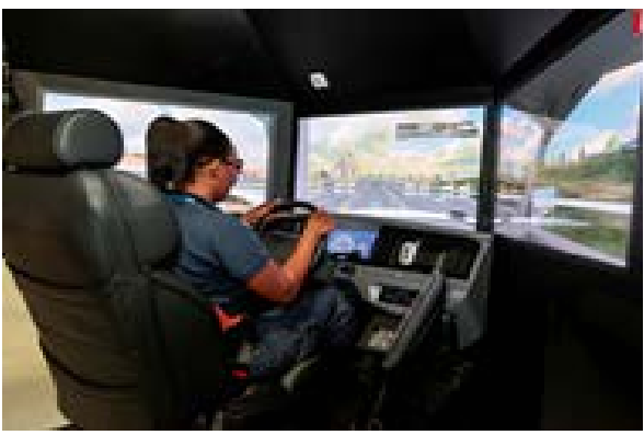
FLETC students training on driving simulators.

careers. Joint training also promotes interoperability, which leads to increased cooperation and intelligencesharing in the field. The qualitative benefits of the consolidated training model extend to FLETC's curriculum development and review process, which leverages the wide-reaching expertise of FLETC's partner organization community to share and vet ideas about training content and methodology.