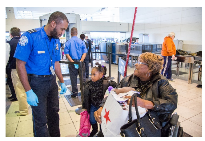
A TSA Officer attends to a passenger during the screenin process at an airport checkpoint.

TSA is committed to the highest level of security for the United States across all modes of transportation. The Nation's economy depends upon implementation of transportation security measures that are both effective and efficient. Public confidence in the security of the Nation's transportation systems ensures the continued success and growth of the Nation's economy. TSA engages the public in securing the transportation system by encouraging them to report suspicious behavior. TSA also strives to provide excellent customer service by providing information to all travelers