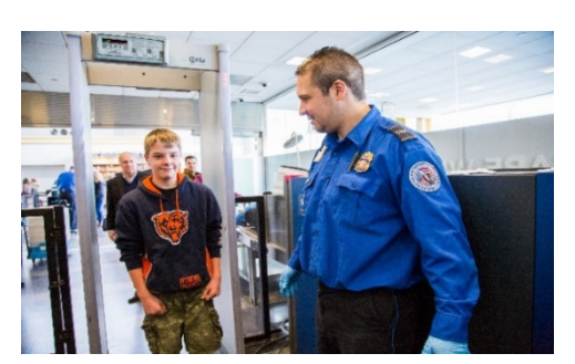
A Transportation Security Officer at Ronald Reagan Washington National Airport ensures a smooth screening process.

U.S. transportation systems accommodate approximately 823 million domestic and international aviation passengers per year, 604 million passengers traveling on buses each year, more than 10 billion passenger trips on mass transit per year, 26 million students daily on school buses, nearly 900,000 chemical shipments every day, approximately 140,000 miles of railroad track, 4 million miles of highway, 612 thousand highway bridges, 473 road tunnels, and nearly 2.7 million miles of pipeline.