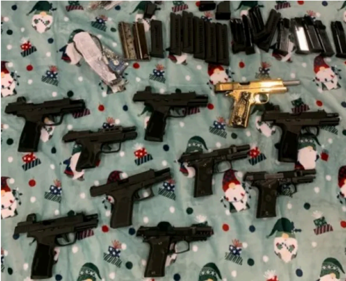
US Border Patrol agents seized various guns and ammunition during Operation Magnolia