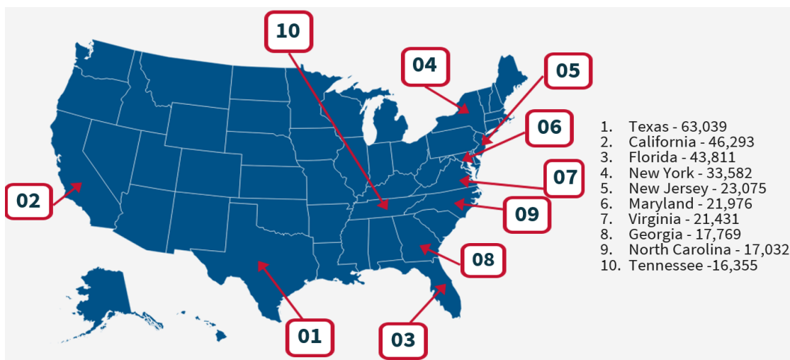
Figure 1. Top 10 States Where HHS ORR Released Unaccompanied Alien Children to Sponsors, FYs 2019–2023