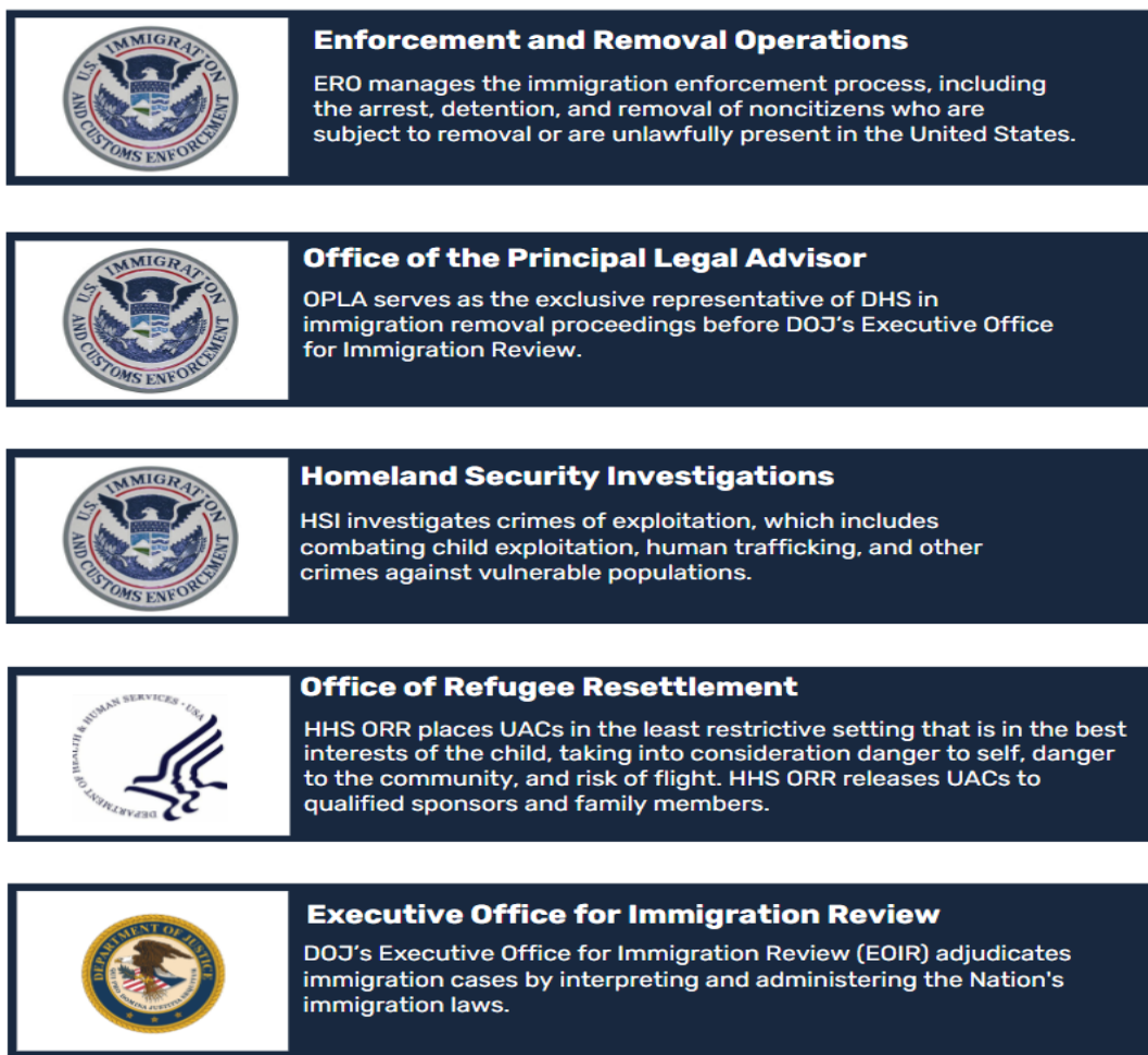
Figure 2. Federal Agencies 13 and ICE Offices Involved with Unaccompanied Alien Children Released or Transferred from DHS and HHS' Custody