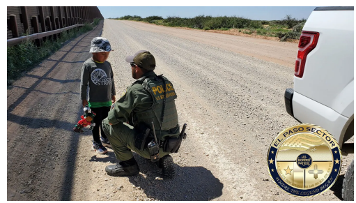
Border Patrol agents rescue a migrant child abandoned by smugglers.

Sources told NewsNation that the cameras used by CBP agents are Avon body cams, which the social media post claims are devices BLE Radar, which was developed by F-Droid, can detect.