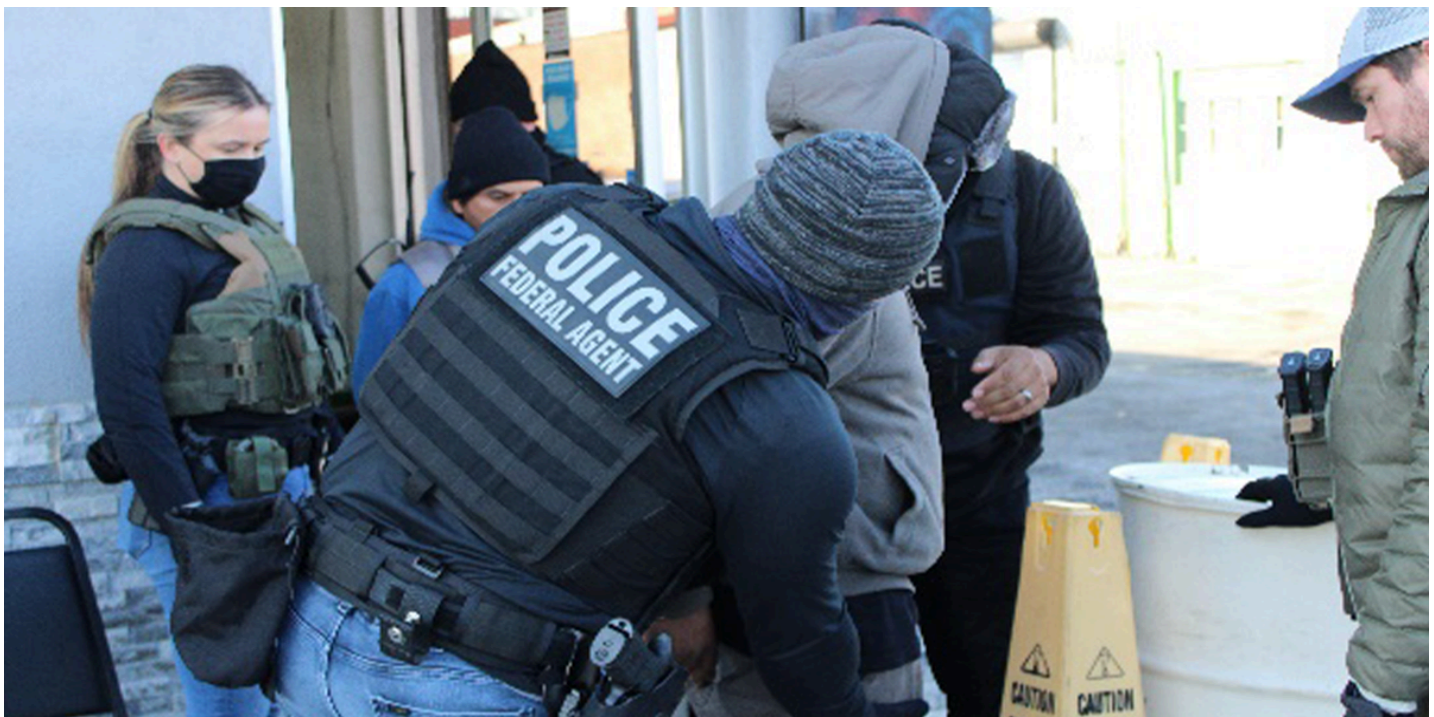
ICE agents arrested seven illegal immigrants during a workforce operation raid.

"We are fending off the hangover and some of the bad habits," a senior ICE official told Fox News Digital, comparing the task to turning around the Titanic. "We are fixing four years of really bad habits."