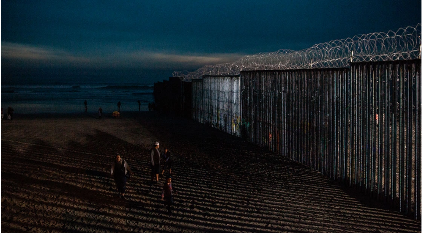
Las Playas de Tijuana on December 9, 2018. At night the beach is lit up with lights from the U.S. side to help US Customs and Border Patrol find people trying to cross illegally.